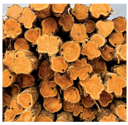
Standard + 40 Premium 40-89 Premium + 90